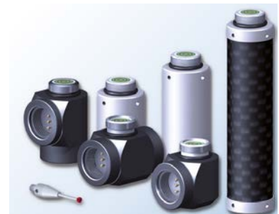
Various accessories available