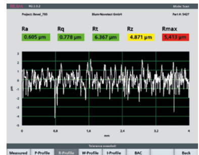
Display and operation via machine control or BLUM touch panel