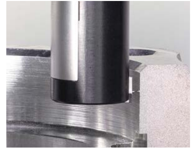
TC63-RG – for high-precision roughness measurement on plane surfaces