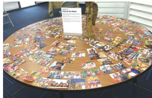
Station #12 - Pray for the World On this table were photos of people from every nation except the United States. Participants were asked to pray and pick a photo. On the back of the photo was the name of the country the photo represented. They were asked to pray for that country that they would find and know Jesus.