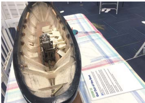
Station #10 - Get Out of the Boat Participants were encouraged to write down those things of which they are frightened that keep them from getting closer to Jesus and following Him. After folding the paper, they were asked to place them in the bottom of the boat.