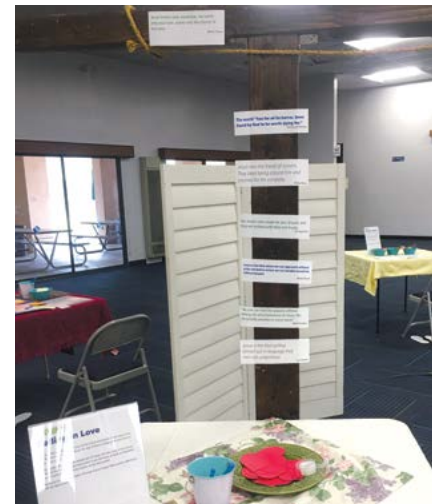
Station #9 - Falling in Love Various reflections on Jesus were taped to the cross. Using these quotes, participants were asked to write on a red heart how they spoke to their personal love of Jesus.