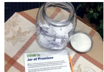
Station #13 - Jar of Promises This last station asked participants to pray as they picked a scripture of promise and encouragement from the jar.