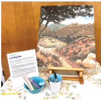
Station #1 - Letting Go This first station asked participants to let go of those things that could hinder God speaking through the walk using bubbles or popsicle sticks.

In contrast to the Good Friday Service, our regular Easter service was filled with joy at the resurrection of Jesus! With beautiful worship songs and resounding hymns, a message that encouraged us to trust Jesus, communion, and a glorious rendition of the "Hallelujah!" chorus sung by the choir and congregation, Resurrection Sunday was celebrated jubilantly.