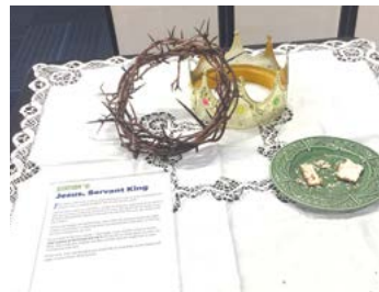
Station #8 - Jesus, Servant King Matzah, the bread served at the Last Supper, was eaten as a symbol of Jesus' body as participants reflected on the King of kings as a Servant King - giving his life for many.