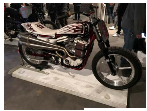
Amazing custom paint job on 1997 Harley-Davidson Sportster