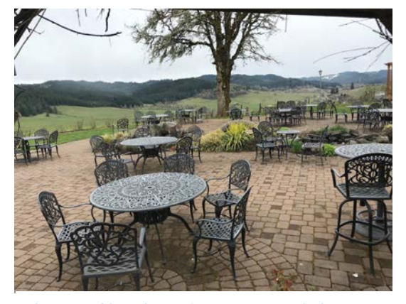
Sweet Cheeks Winery-one of the stops on Thursday's route