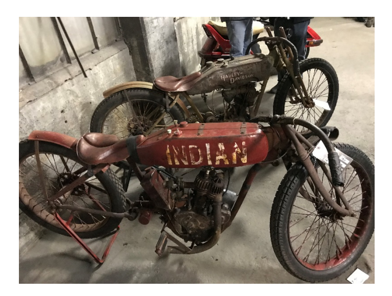
1919 Indian Racer & 1920 Harley Davidson Racer