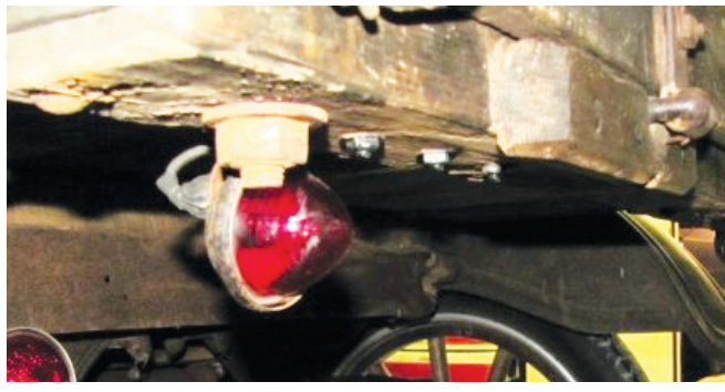
Clearance lamps mounted under my wood Pickup bed, one on each side. They are wired to a switch connected to the brake pedal.

For previous technical articles printed in the Model T Times , visit www.modelt.org and click on "Model T Ford Repair, Service, & Restoration".