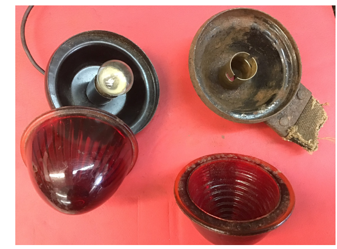
Newer and vintage clearance lamps suitable for tail lamp or stop lamp use