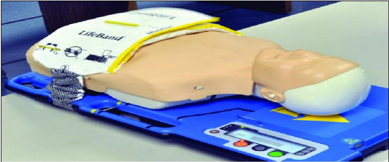
Cardiac Compression Machines