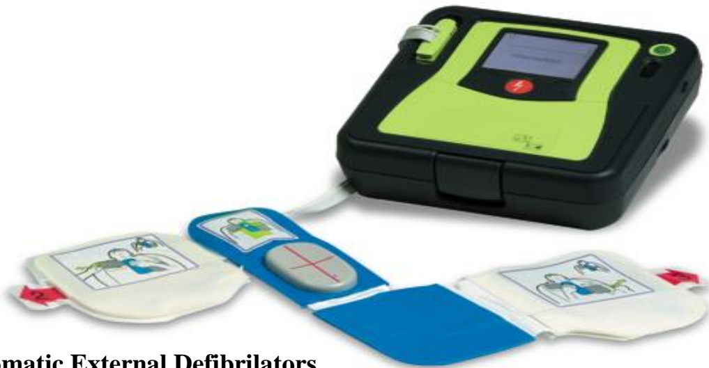
Automatic External Defibrillators