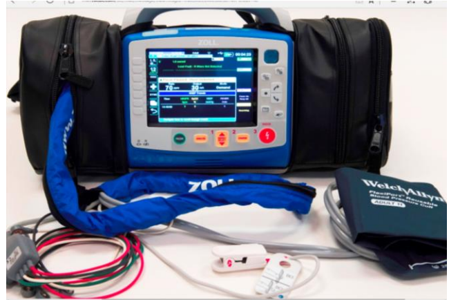
12 Lead Cardiac Monitor