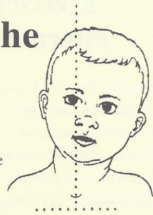
Left head tilt

A tight muscle (sternocleidomastoid) on your baby's left side of the neck causes a head tilt to the left. This tight muscle probably attributed to the baby's preference for turning right (thus the flat spot on the right), and can greatly affect the symmetry of the head, face and ears.