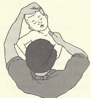
Sidebend Stretch (End position)

Do the stretches slowly. The infant may resist, due to frustration or tightness, not pain. You may prepare the muscle with a gentle massage or warm compress. A toy can help focus the baby's attention in the right direction.