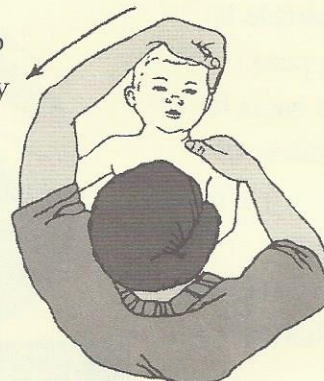
2. Sidebend Stretch (Start position)

(This exercise is designed to sidebend the right ear to the right shoulder).