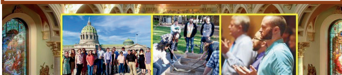
Harrisburg Young Adult Catholics

More information can be found at our Facebook group: https://www.facebook.com/groups/568131137998438/ .