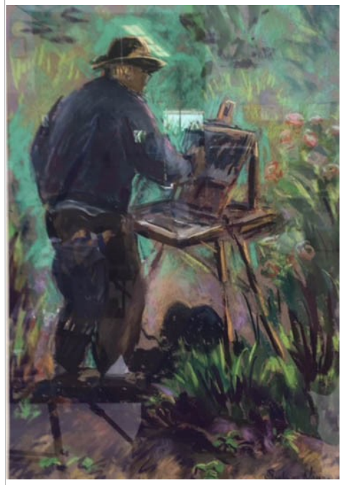
Best of Show - The Painter Suha Noursi