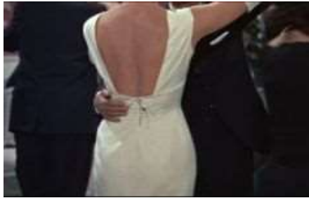
– Doris Day: Dance scene in Pillow Talk