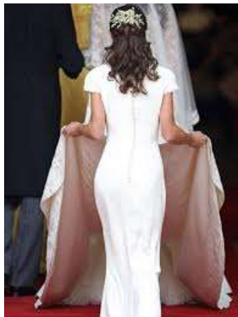
– No need to identify.