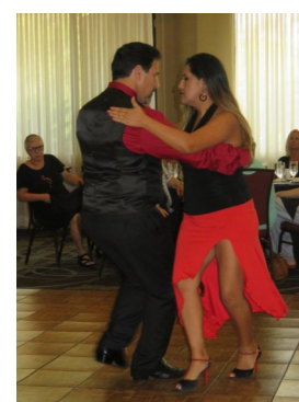
One of their intricate tango steps.