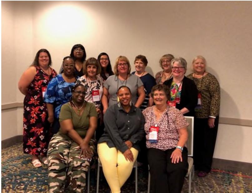
Left: NALS of Michigan members at the NALS Forum in Little Rock, Arkansas.

Thank you again for the opportunity to attend another national conference!