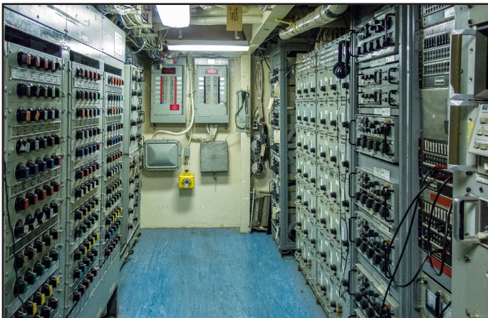
The interior of the Iowa's radio room.