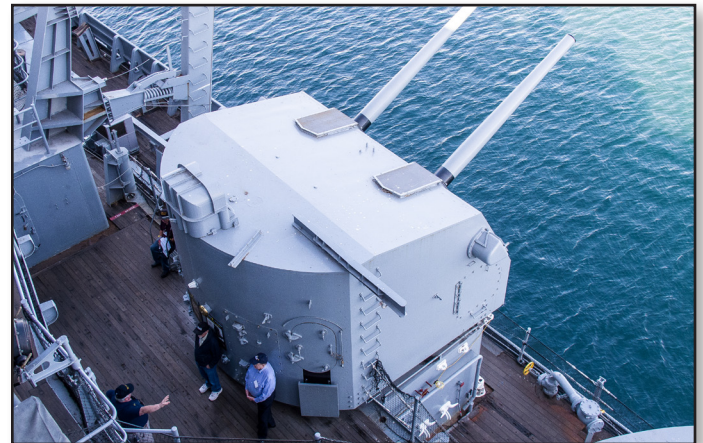
Exterior view of a 5 inch 38 caliber dual gun mount on the Iowa.