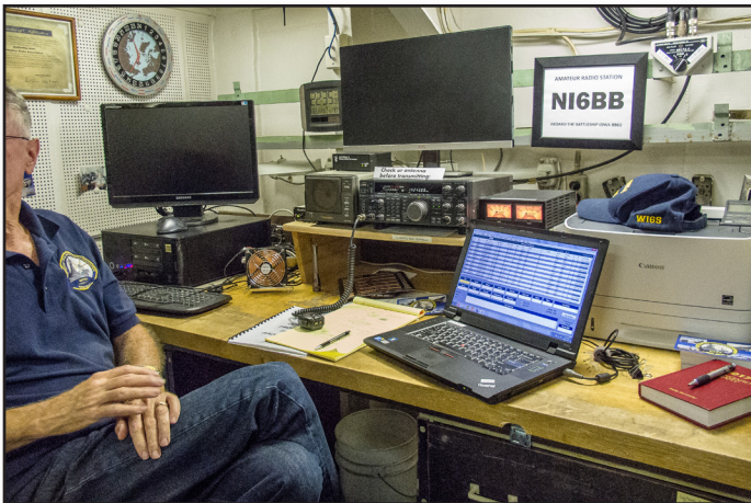
One of the ham radio positions in the Iowa's radio room.

It was an enjoyable convention at a nice hotel with excellent facilities and services. ♦