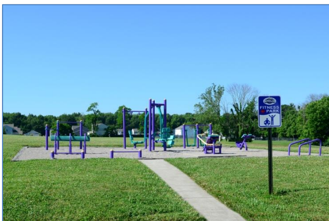
Amelia Fitness Park

Spencer Shank Park also has a great Frisbee Golf course, the Dog Park, and the Amelia Fitness Park. The shelter can be rented for private parties, gatherings and functions. Groh Park also has some new equipment that Amelia received through a grant. It will also be installed soon. One piece has already been installed.