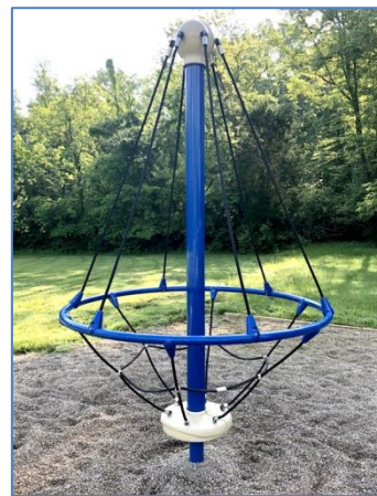
Groh Park new equipment