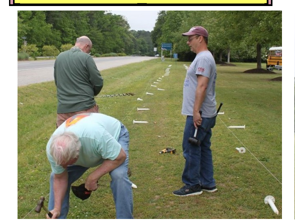
Club Members Setting Up the Display of 100 US Flags Along George Washington Parkway for the Week Preceding and Including Memorial Day