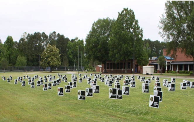
Markers Commemorating Individuals Lost in Past Wars Set Up by Club Members for Memorial Day 2020 In York HS Field Adjacent to George Washington Parkway