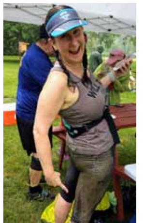
<u>Link to</u> <u>YouTube video.</u>