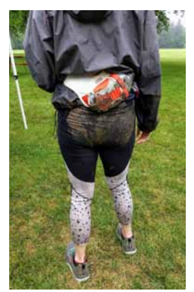
Click to see more photos...