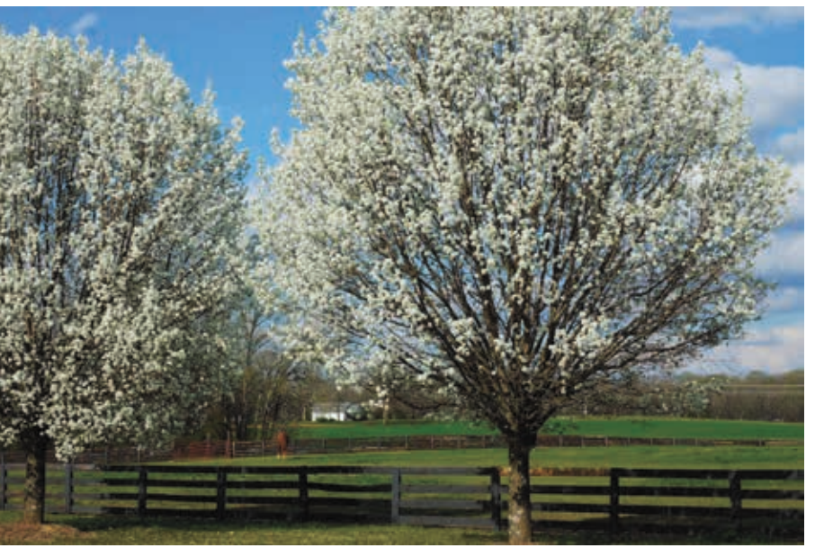
There are plenty of pastures at Chestnut Lane Farm, giving space for horses to enjoy their down time or for boarders to enjoy turning their horses out.