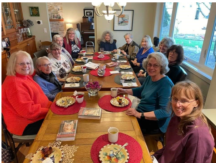
Photo from January's Book Club gathering.