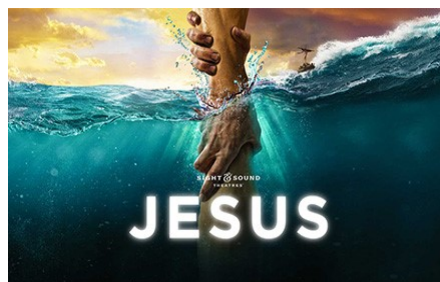
Jesus Show Sight and sound