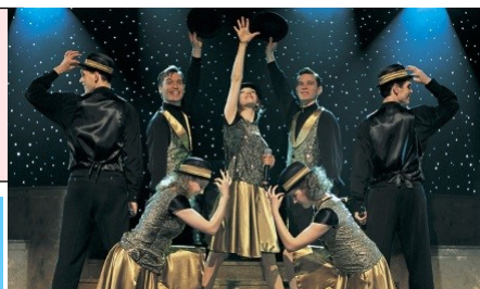
The Hughes Show

Departs from Scenic Hills Senior Center 187 S. Spring St. @ 8:00 am