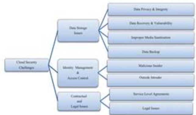
Fig.2: Cloud Security Challenges

distributed computing model is all the more unprotected against security perils similarly as above conditions. Because of ease cloud customers are expanding exponentially and applications are encouraged in cloud is high. These conditions provoke more conspicuous security perils to cloud clients. If any strike is compelling on data (information) component will prompts data (information) break and takes an unapproved access to data (information) of all cloud customers. Because of this respectability encroachment cloud data (information) lost multi-inhabitant nature.