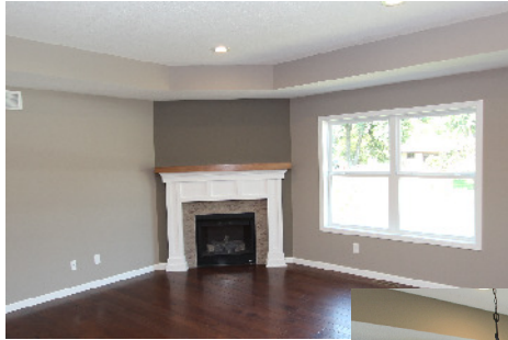
PHOTOS OF PREVIOUS HOME