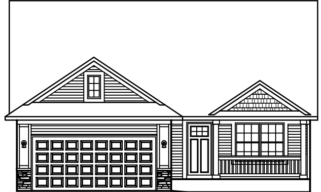
SOME OPTIONS MAY BE SHOWN