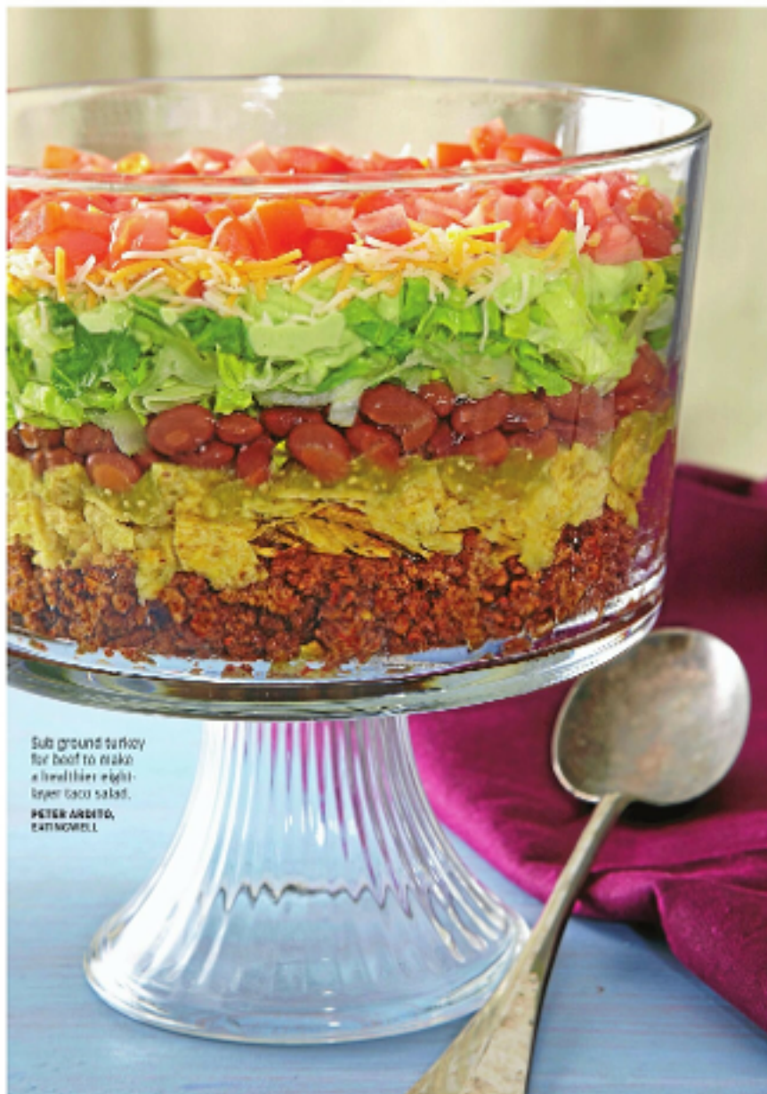
Sub ground turkey for beef to make a healthier eight-layer taco salad.