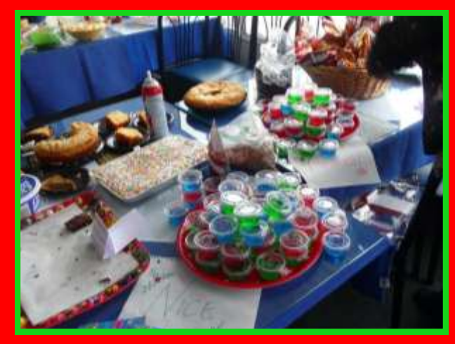
What a spread!!!!