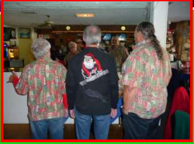
Good phun and recognition!!!