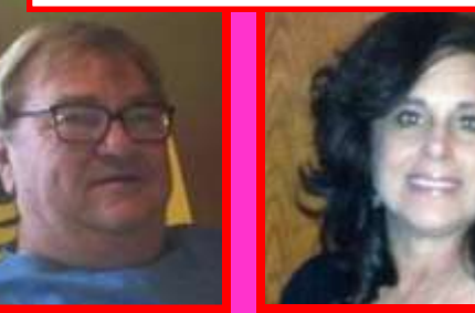
Happy Valentines' Day!!!!