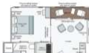
Owner's One-Bedroom Suite