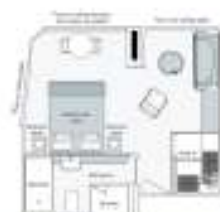
Emerald Riverview Suite