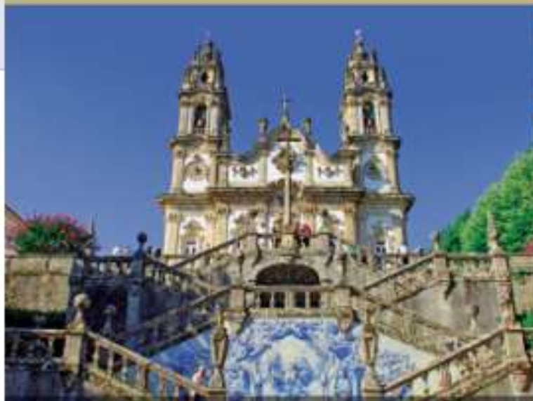
Tile work adorns the Sanctuary of Our Lady of Remedios, Lamego, Portugal