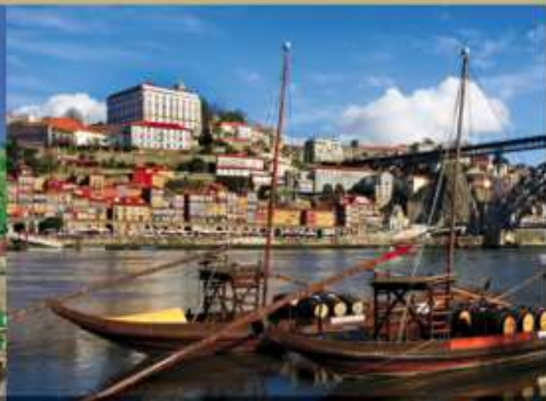
The quaint and historic town of Porto, Portugal

and typical communities with vineyards and small farms. This afternoon, the ship arrives in the village of Pinhão, perfectly situated on a river bend surrounded by terraced hillsides that produce some of the world's best Port wine. Meals: B, L, D