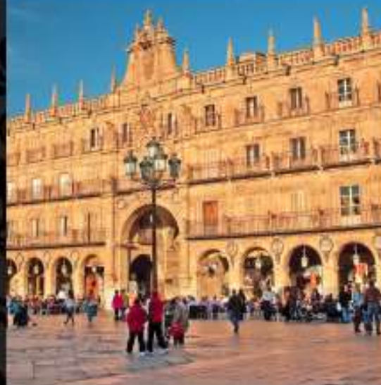
Plaza Mayor, Salamanca, Spain