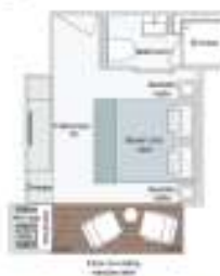
Panorama Balcony Suite