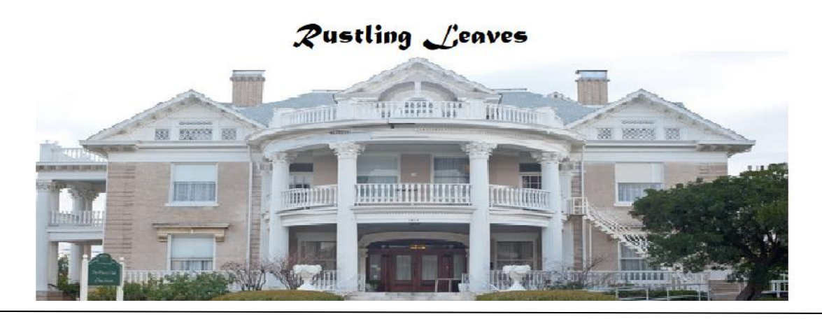
June 2024 Newsletter of the Woman's Club of San Antonio Volume 125, Issue 6