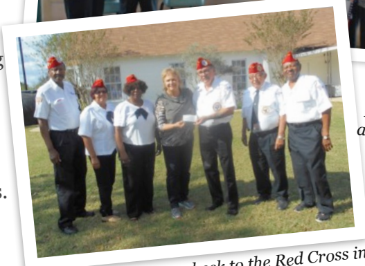
TREA presents a check to the Red Cross in Sutherland Springs

Meet more satellites in our next newsletter!