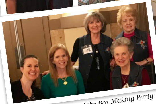
TOL members attend the Box Making Party