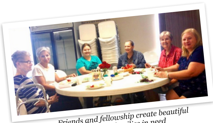
Friends and fellowship create beautiful items for families in need