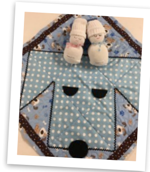
Lovies and quilts are customized for both boys and girls

Contact Louise Patterson at 830-765-0970.