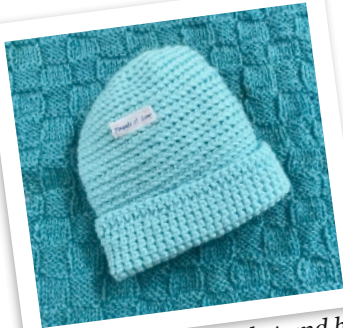
A handcrafted blanket and hat

Contact Holy Spirit for further information on their Prayer Shawl Ministry.