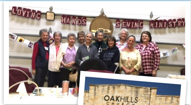
Members of the Loving Hands satellite