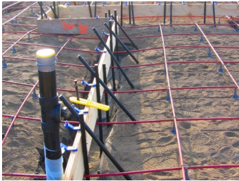
3. Using duplex nails, nail forms directly to Vapor Stake™