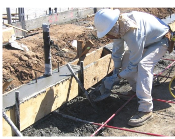
4 . Cut Vapor Stake <sup>™</sup> above the seal but below the finished surface