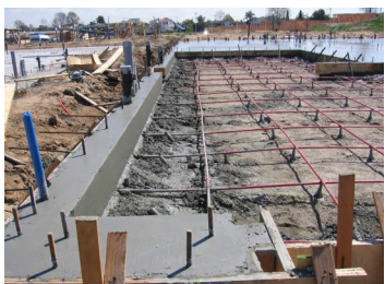
5. Permanently leave the lower portion of Vapor Stake<sup>TM</sup>