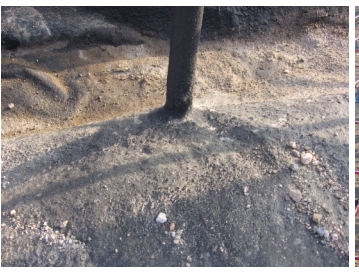
2. Seal barrier directly to VaporStake<sup>TM</sup>