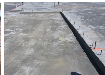
6. Finish slab over VaporStakeTM