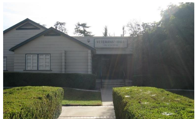
Front and side views of the Veterans Hall

The LVHS has several artifacts from Post N. 330, which it hopes to display at the Veterans Hall in one of our new display cases. The Veterans Hall is the site of many city-sponsored activities. On December 14, 2018, at 5:00pm., join the LVHS at the Veterans Hall for its holiday potluck and silent auction.