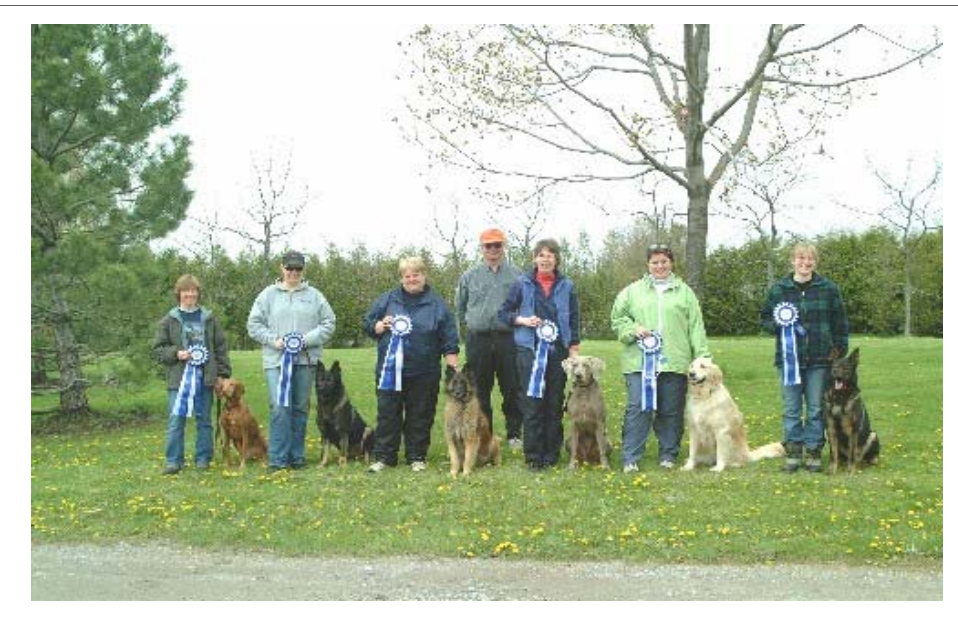
CCTC's 19th Tracking Test.

On May 9<sup>th</sup> 2004 we had the best weather conditions for a Tracking test !! Plotting day rain, test day, partly sunny.