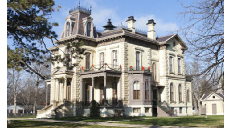
We will tour this beautifully restored, nineteenth-century estate and home of Judge David Davis and his wife Sarah.

All members are invited to attend the luncheon and tour, along with their guests and children, as well as