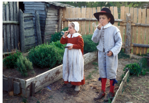
Blowing bubbles was a popular pastime for children.