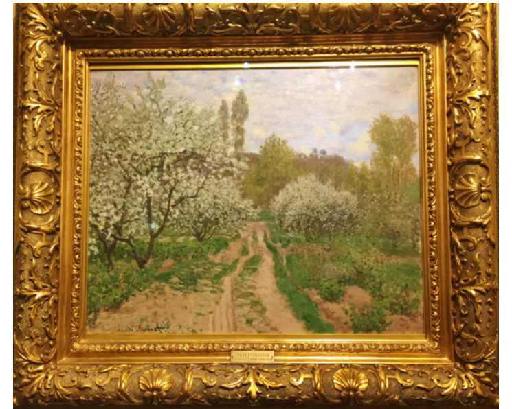
This is the only non-American painting in the collection, but it is a Monet so that makes it okay! The painting is often on loan for Monet exhibits in museums around the world.