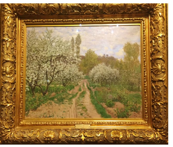
This is the only non-American painting in the collection, but it is a Monet so that makes it okay! The painting is often on loan for Monet exhibits in museums around the world.