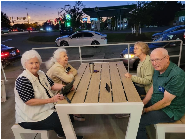
At the Sonic