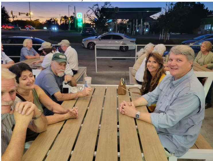
At the Sonic