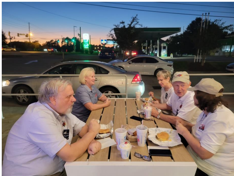
At the Sonic