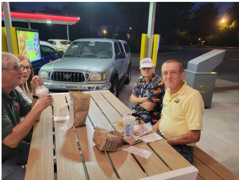
At the Sonic