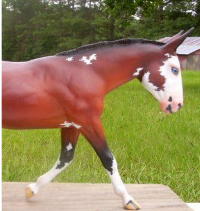
Gaited, Fox Trot, Walking Trail Pleasure Head Set