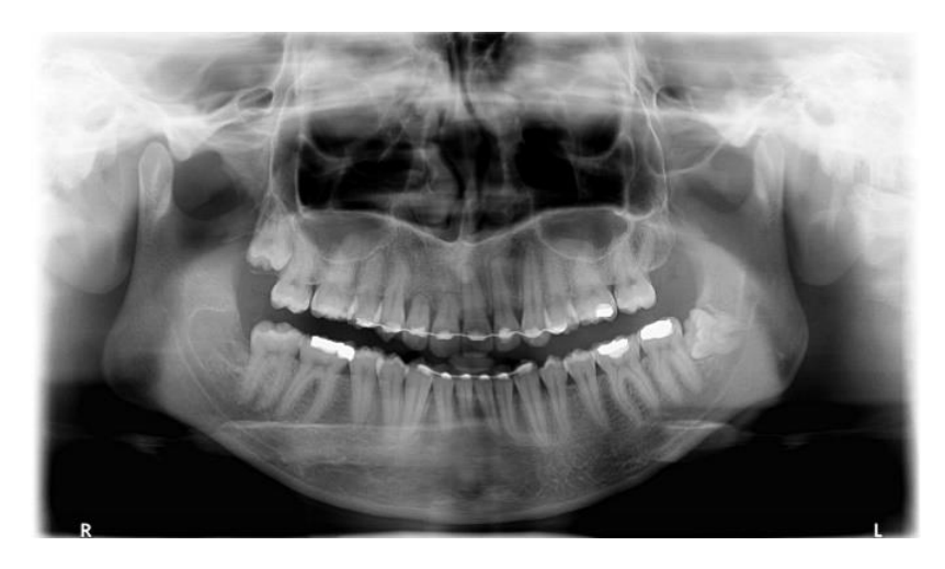
Figure 6. Panoramic radiograph 1.5 years after treatment.