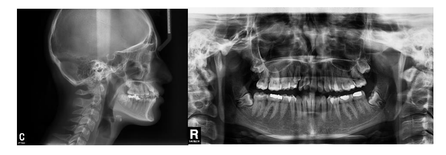
Figure 2. Initial lateral cephalometric radiograph, panoramic radiograph.

Figure 1. Initial facial and intraoral photographs.