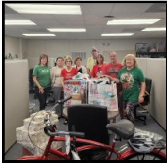
Adopted families gift deliveries to the Highlands School system

Once again, our members donated generously, providing pre-wrapped gifts for four families selected by the Highlands County School System, and gift baskets for residents at five group homes at Ridge Area ARC. Again, thank you to all our members who donated to these causes.