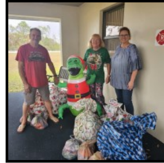
ARC Family Homes Basket Deliveries