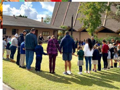
Far left: Students pray over shoe boxes sent out for Operation Christmas Child.