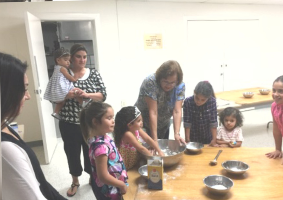
Making Mas with Sunday School - October 9, 2016