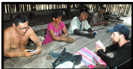
Grant sharing Bible

The pictures in this newsletter give you a good idea about what is happening. For the fuller picture, you won't want to miss our never-before-seen video footage and photographs! (For regular blog updates (SEE DETAILS AT END OF NEWSLETTER))