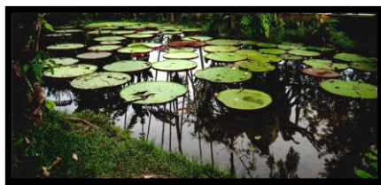
Giant Water Lily Leaves

LIMPOPO: Ellisras, Soutpansberg, Valley of the Olifants, Ba-Phalaborwa, Bela-Bela, Bosbokrand, Duiwelskloof, Lephallale, Giyani, Hoedspruit, Waterberg, Letsitele, Leydsdorp, Louis Trichardt, Modimolle, Mogwadi, Mokopane, Potgietersrus, Nylstroom, Dendron, Messina, Naboomspruit, Mookgophong, Phalaborwa, Polokwane (Pietersburg), Seshego, Thabazimbi, Thohoyandou, Tzaneen, Vaalwater, Soutpansberg, Capricorn, Moria, Bandelierkop, Dendron, Roedtan.