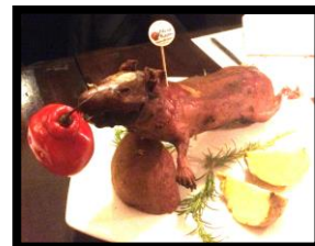
Fried Guinea Pig

You and I are so privileged to respond to God's call today! Whether you choose to be His witness where you live and work or to travel further afield, there is much that we can do to enroll in this war as co-fighters together with JESUS CHRIST against satan.