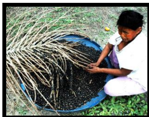
Asai Palm Fruit

LIMPOPO: Ellisras, Soutpansberg, Valley of the Olifants, Ba-Phalaborwa, Bela-Bela, Bosbokrand, Duiwelskloof, Lephallale, Giyani, Hoedspruit, Waterberg, Letsitele, Leydsdorp, Louis Trichardt, Modimolle, Mogwadi, Mokopane, Potgietersrus, Nylstroom, Dendron, Messina, Naboomspruit, Mookgophong, Phalaborwa, Polokwane (Pietersburg), Seshego, Thabazimbi, Thohoyandou, Tzaneen, Vaalwater, Soutpansberg, Capricorn, Moria, Bandelierkop, Dendron, Roedtan.