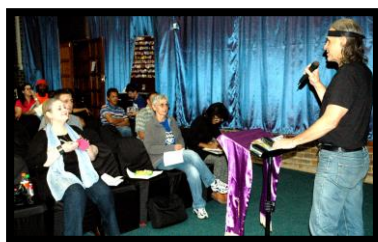
Teaching at Solid Rock