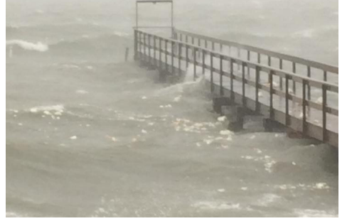
Mother Nature and the PL