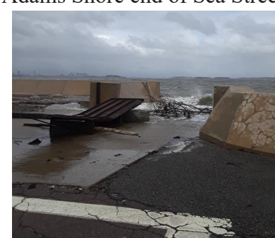
Damaged Sea Wall at Perry Beach