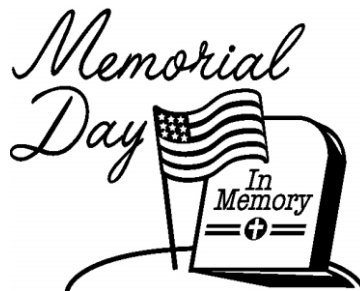
May 28 - Remembrance