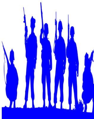
Armed Forces Day – May 19