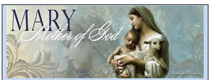
Solemnity of Mary Mass Schedule: December 31<sup>st</sup> at 7PM January 1<sup>st</sup> at 10AM