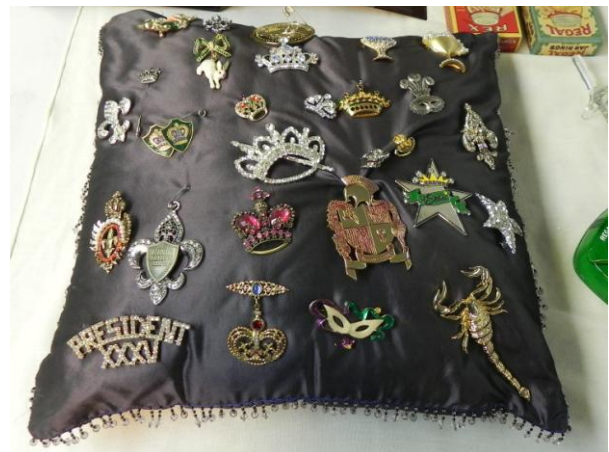
Glenn Plauche's Mardi Gras pin collection