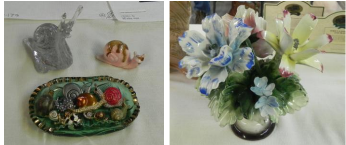
Pictured from left: Allison Clark's Snail collection, Dianne Cook's capolimonte porcelain flowers