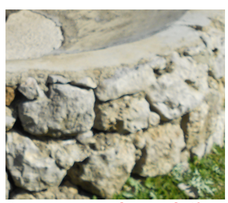
Stone represents the stone knife.

For the rest of its OT history, Israel will continually contrast itself with "the uncircumcised."