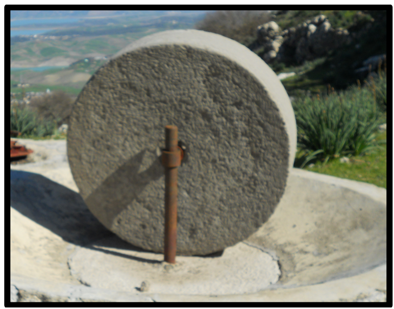
The precision mechanics are required for purpose to be achieved

Exodus 20-23 is the part of the COVENANT which includes a code meant to give Israel a common pattern of conduct as well as bind them to their Suzerain God