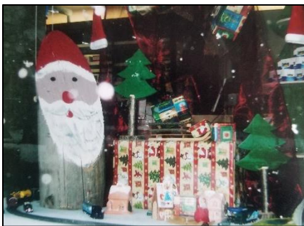
Store window in Bad Herrenalb