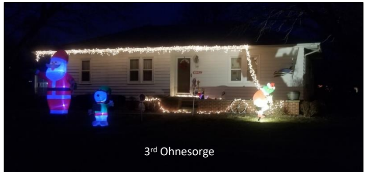
3 rd Ohnesorge