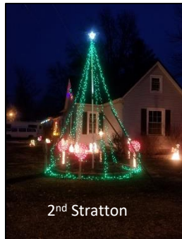
2 nd Stratton