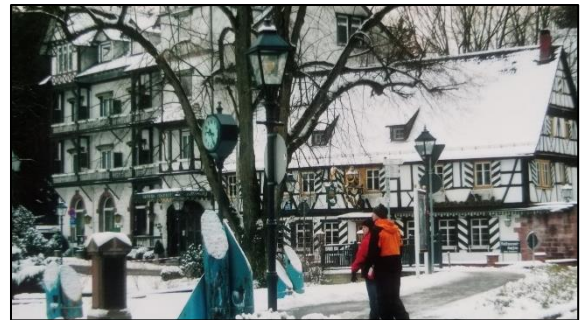
Wooden Santa faces covered with snow in Bad Herrenalb Germany