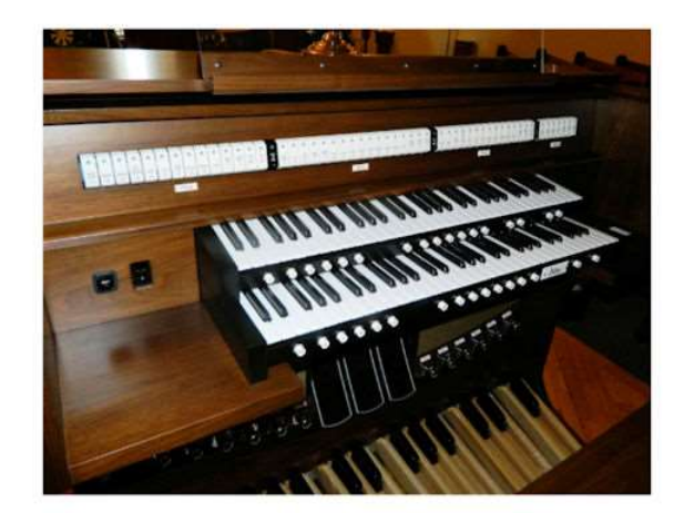
St. Paul's Beautiful New Allen Organ