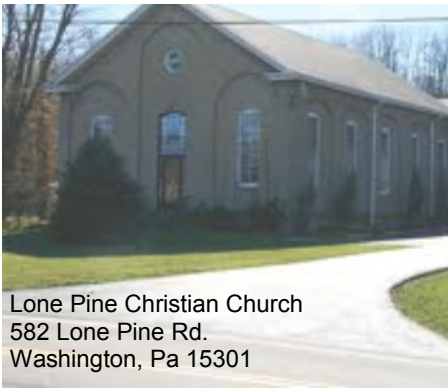
Lone Pine Christian Church 582 Lone Pine Rd. Washington, Pa 15301