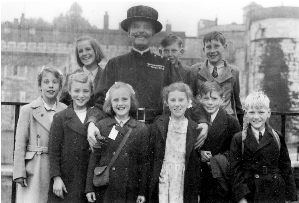
Toft School outing Tower of London late 1940s