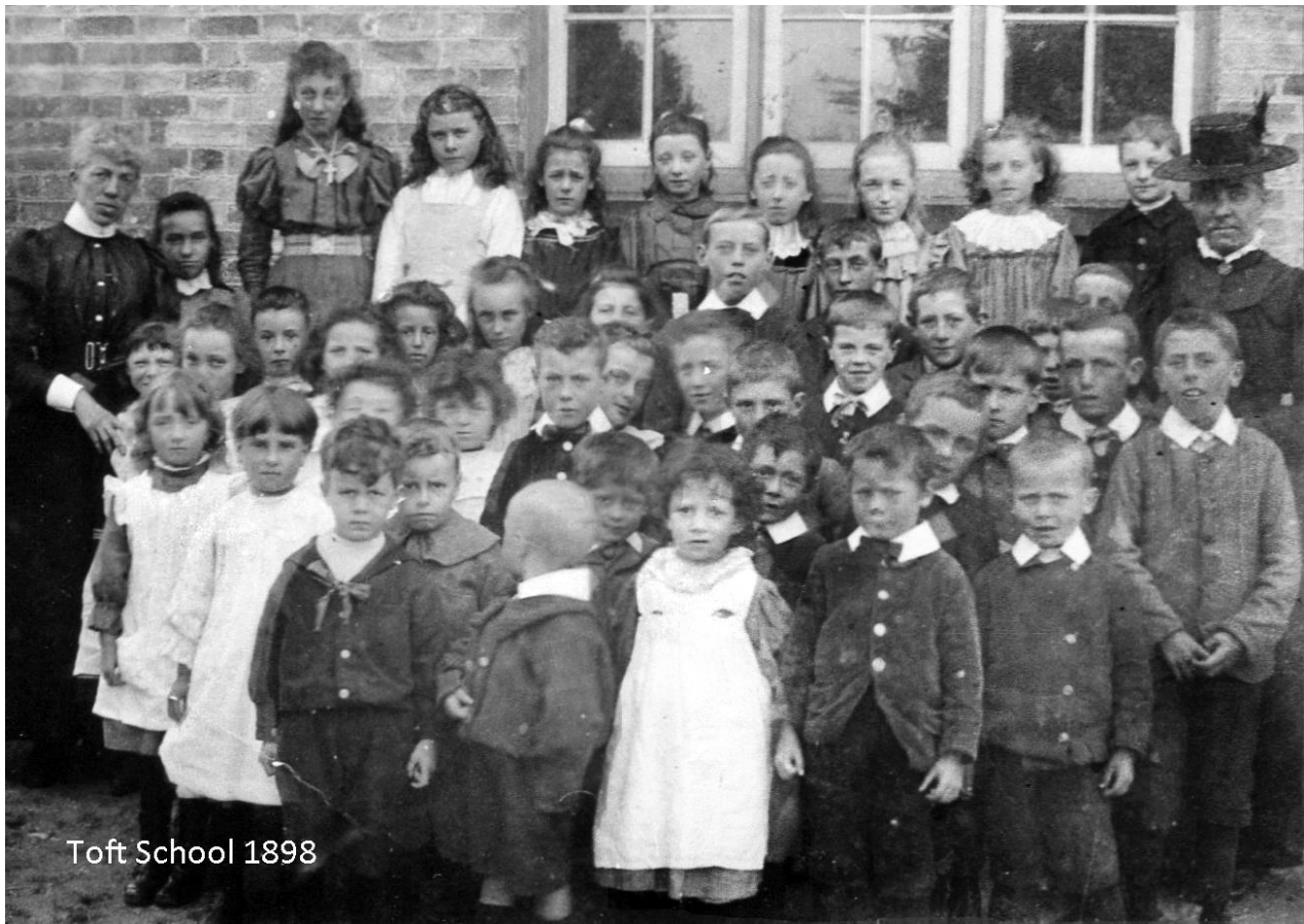
Toft School 1898