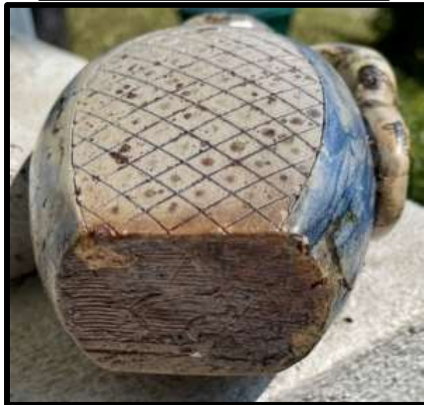
Note the great Kirkpatrick's Anna Pottery traits, clay and glaze colors.