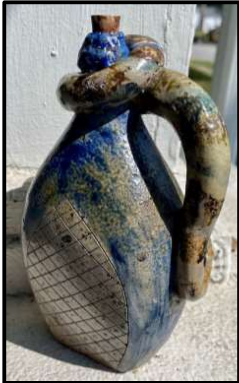
Snake flask displaying the great influence of the Kirkpatrick's Anna Pottery.