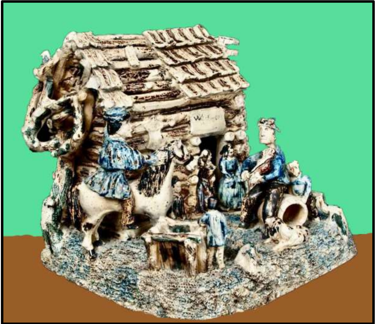
The "Eakin Arkansas Traveler" watering hole setting, featuring multiple cobalt and manganese decorated figurals and mottled base application. 10" H, 11" L, 11" W.