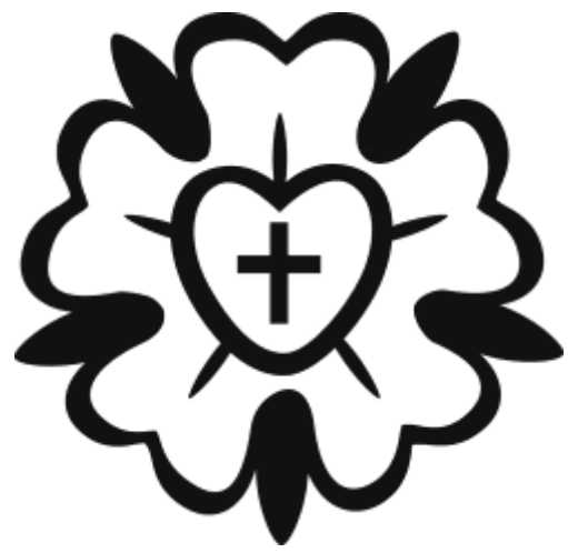
In this issue -