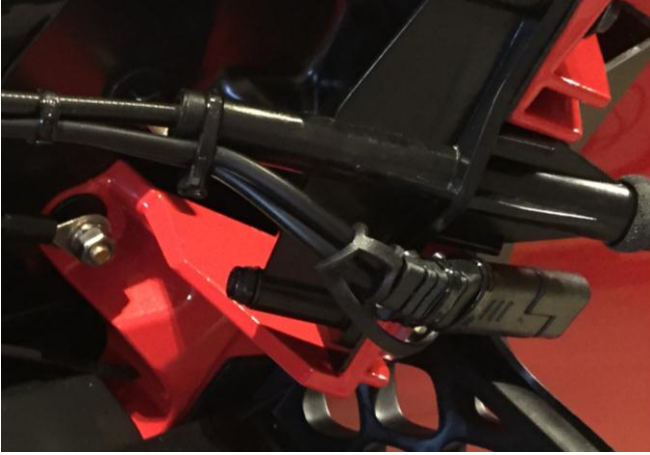
Connector mounting location.

Note location of first ty-wrap securing wiring to plastic housing.