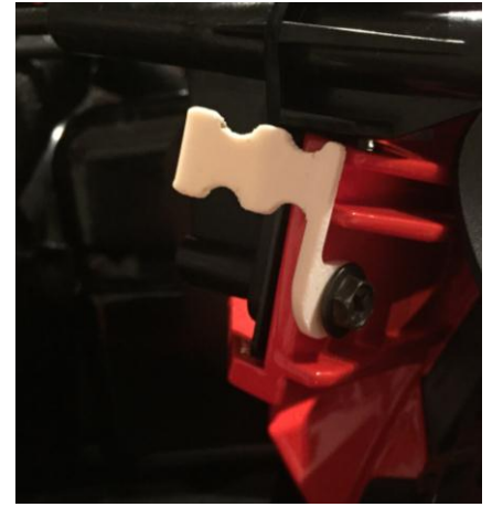
Prototype Connector flag for reference.

See photos on the next page for wiring layout guide.