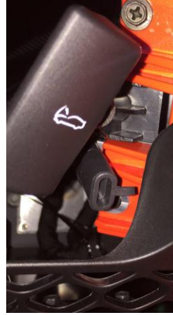
Connector Exit Angle

Note location of first ty-wrap securing wiring to plastic housing.