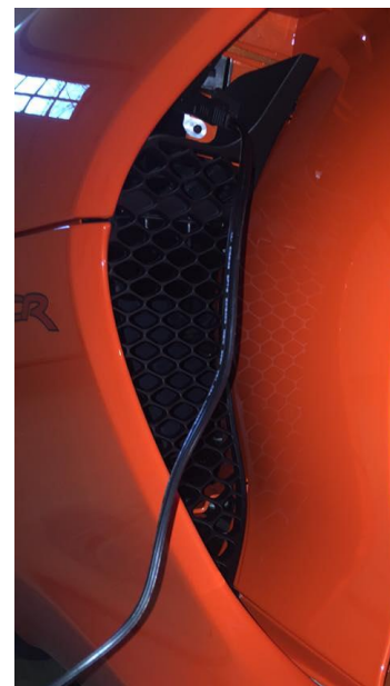
Access from the Driver Side Gill

DSE-VP-BA-003: Gen V Quick Access Charger Connector Mount and Harness