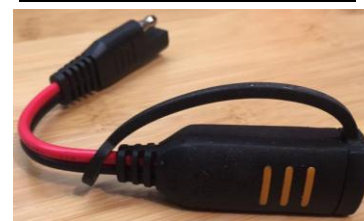
CTEK 55-564 Adapter