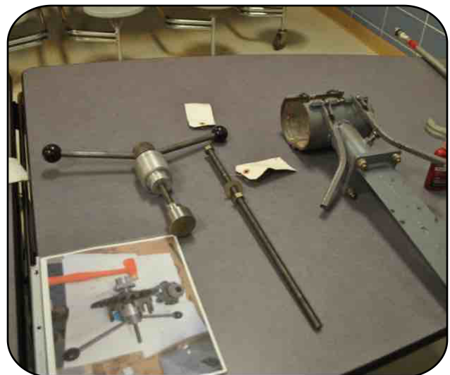
Special tools for differential rebuilding