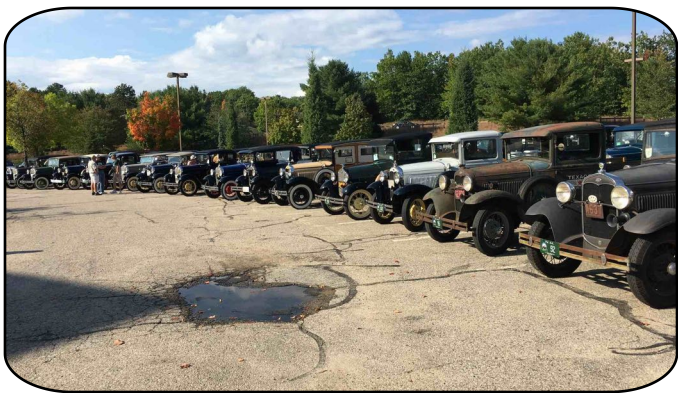
The large line up in the hotel parking lot, The group of friendly Model A' ers from the Northeast that we met and shared time with.

The 2018 New England Model A Meet will be held in Albany, NY next year in September